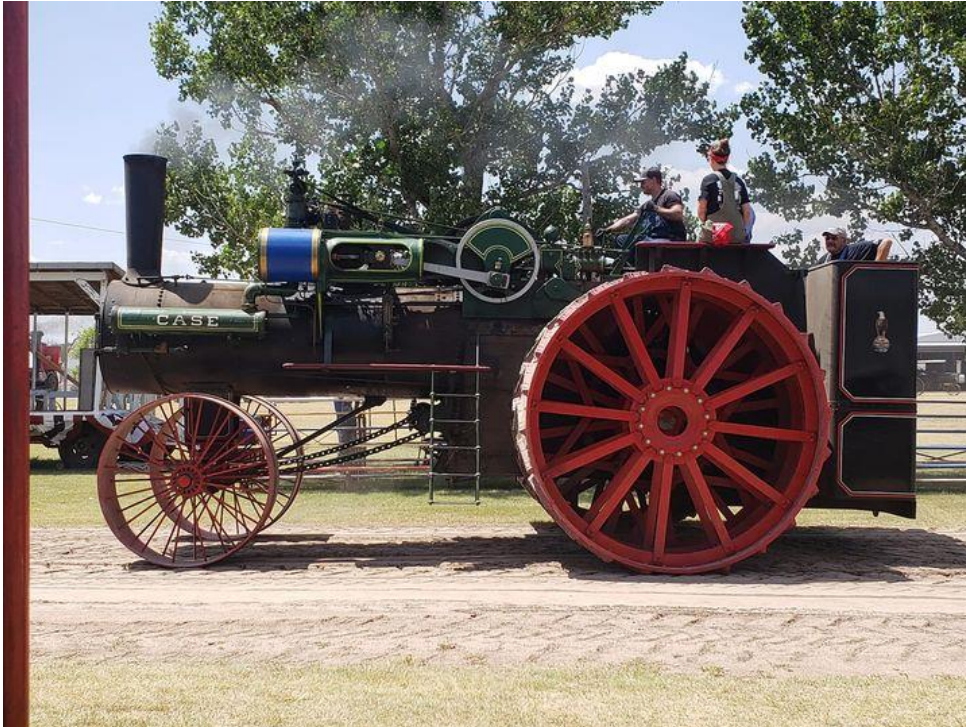
KORY ANDERSON'S 150 ROAD LOCOMOTIVE