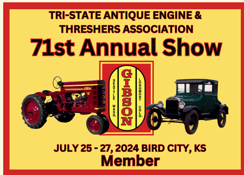
The 2024 Membership Button

You can renew your membership during the semi-annual membership meeting on March 2nd, mail a check to PO Box 9, Bird City, KS 67731 or visit https://threshershow.org/membership/