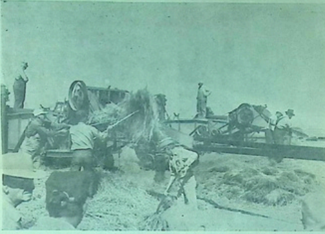
Finishing the Wheat Threshing with Two Outfits

THE FIFTEENTH ANNUAL REUNION TRI-STATE AREA of the